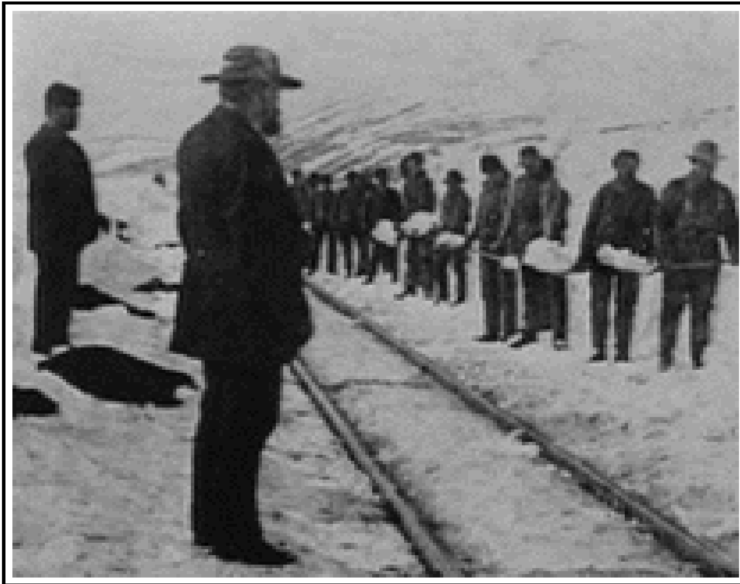
Working conditions were often harsh for laborers.