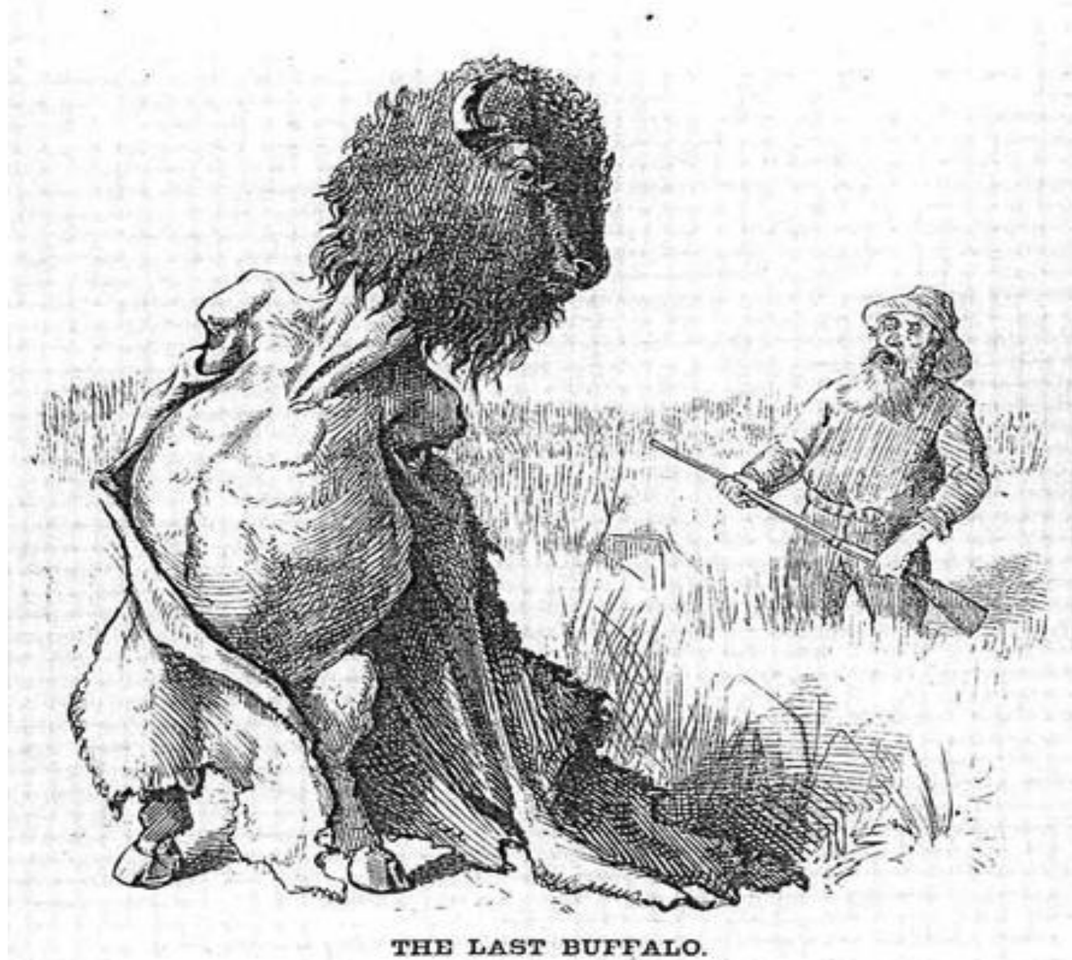
THE LAST BUFFALO.